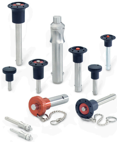
Traditional pins GN 113 / 114