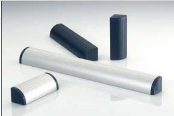
Ledge handles in several variations