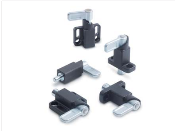
Various spring latches for welding or with flange for surface mounting