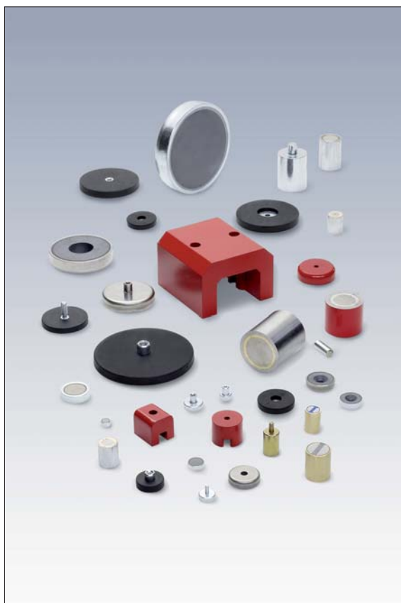
Retaining Magnets for Non-Wearing Fixings