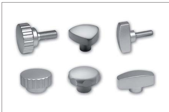
New operating elements extend the stainless steel product range of Ganter