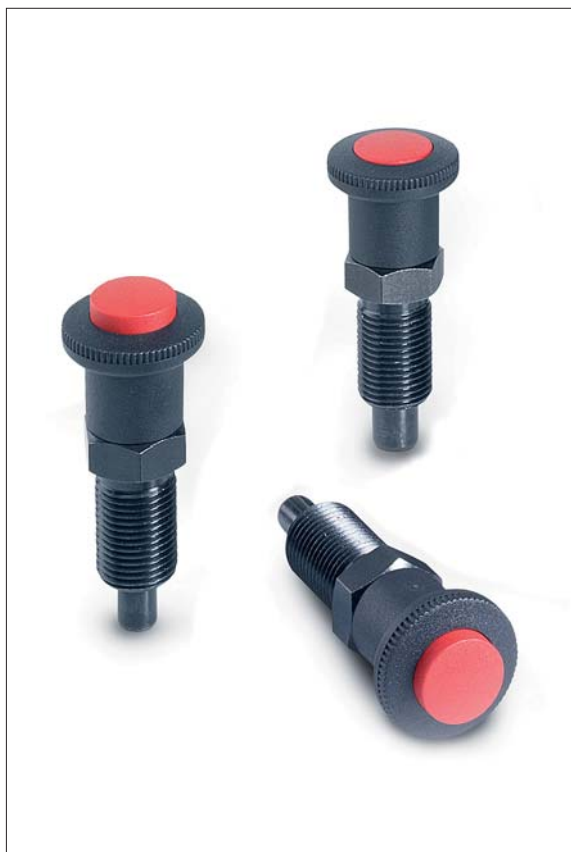
Safety indexing plungers GN 414