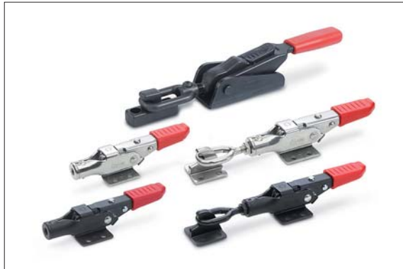
Latch clamps with safety locking mechanism