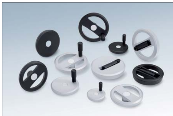
Modern handwheels – both in disk-type and spoke-type design