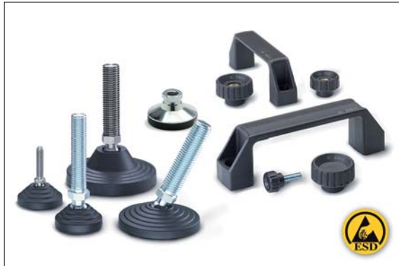
Levelling feet, cabinet "U" handles, knurled nuts and knurled screws in ESD design.