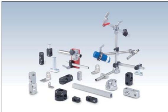
Clamp mountings, retaining tubes and retaining rods in several versions