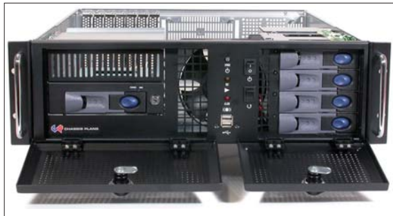
3U rackmount system with GN 425 handles