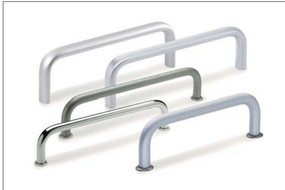
several „u“ handles for 19“ drawers