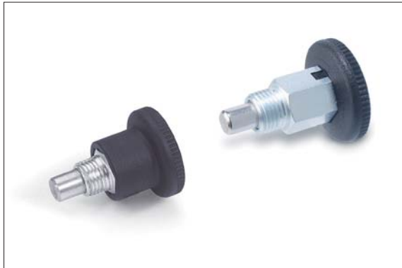
Mini indexing plunger GN 822.1 (back) Mini indexing plunger GN 822 (front)