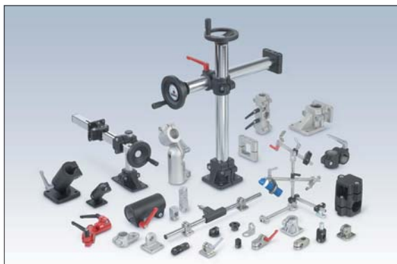
Different versions of tube clamp connectors